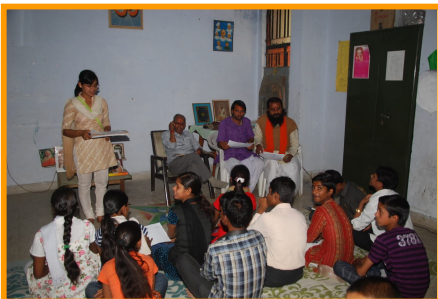
Judges with Participants