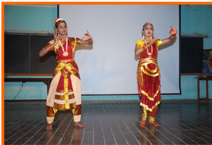
Classical Dance in L-7